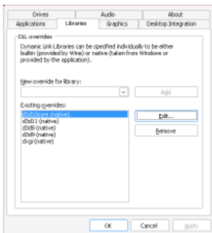
DLL Overrides Dialog

export WINEPREFIX=/path/to/wineprefix cd dxvk-<version>/ cp x64/*.dll $WINEPREFIX/drive_c/windows/system32 cp x32/*.dll $WINEPREFIX/drive_c/windows/syswow64